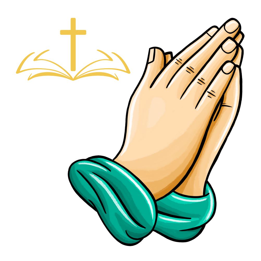
-GOD ANSWERS PRAYERS-